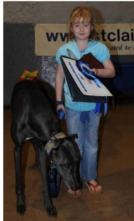
"Duke" Best of show winner

Did you know - That greyhounds are the only breed of dog mentioned in the bible, Proverbs 30 verse 29-31