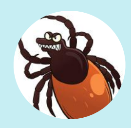
Ticks Find out about how to protect your hound from these wee beasties...