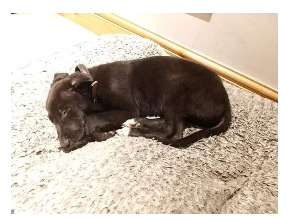
Lupin's first evening