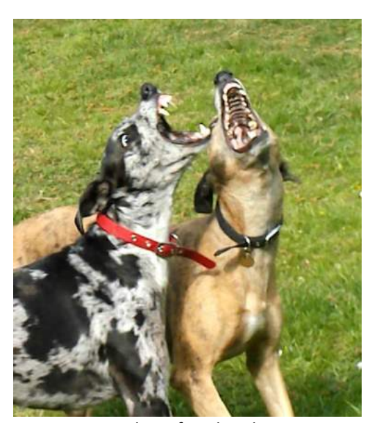
A biteyface howl

It is NOT advisable to interfere in a game of biteyface unless you have a suit of armour complete with gauntlets at hand. The girls engaged in this mad game on many occasions, and I gradually realised that they were neither deranged or vicious, but just having fun....lurcher style.