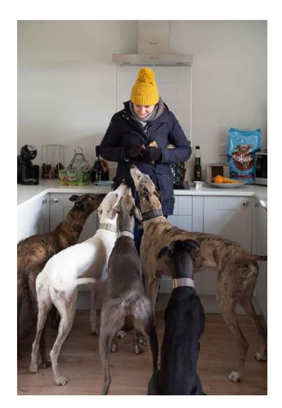
Part of the pack