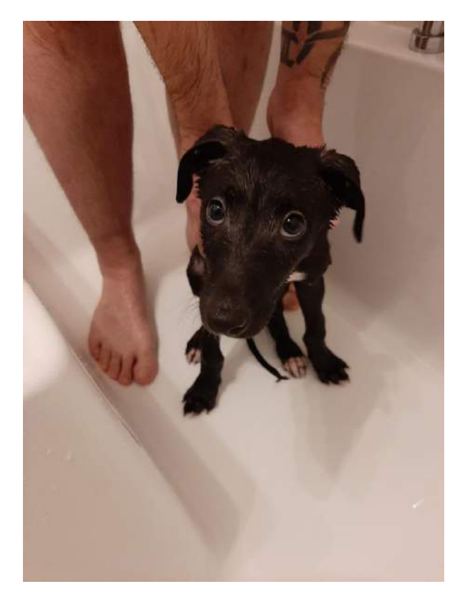
"Enjoying" a shower