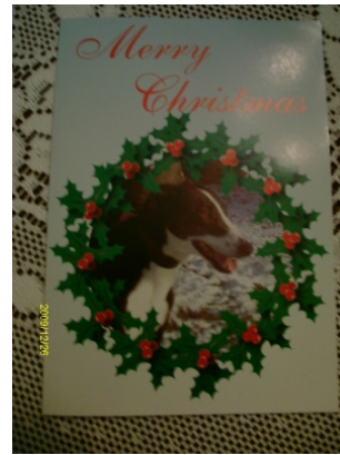
Christmas cards (6 pack) £5