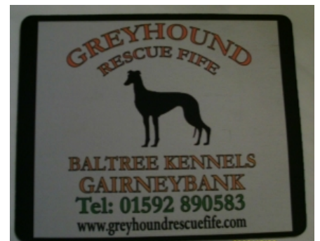
GRF Mouse mat £4