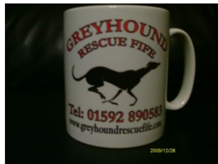
GRF Mug £4.50