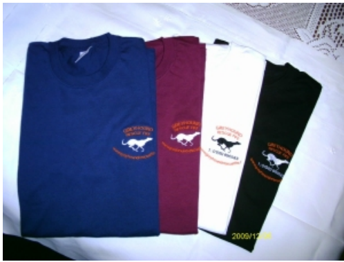
T shirts small - XL £10