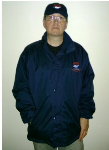
Reversible fleece lined jackets £38

For full details of our regular merchandise items please contact either Bert McCurdy at 01501 751178 or Jimmy at FERNIEJIMMYF@aol.com We also have one or two other items such as dog coats and snoods please get in touch for prices of these.