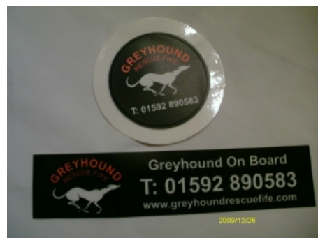
Tax disc holder & windscreen decals £1 each