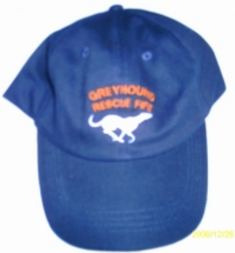
Baseball cap £10

However that is not all ! we also have for sale the following promotional items