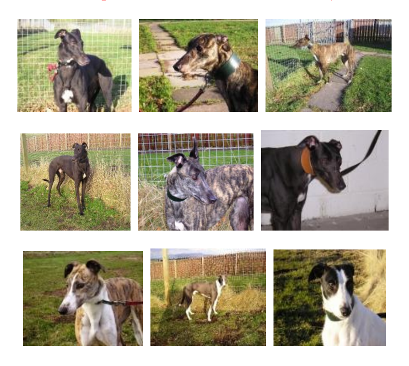
Red = now re-homed (and pictured in the "out" section below) ...

Abbie, Lady, Meg (winner of the Oaks !!!! Our first Classic winner) , Sabre, Bob, Molly , Billy, Trudy, Teenie, Toffee (Madam's daughter), Cracker & Roxy.