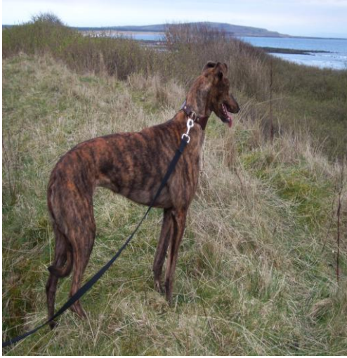
Yes, I KNOW it's not a REAL hare ..... BUT these ARE real rabbits!!