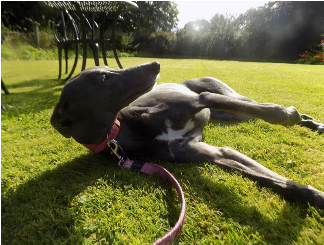
Beautiful Lexi relaxing in the garden