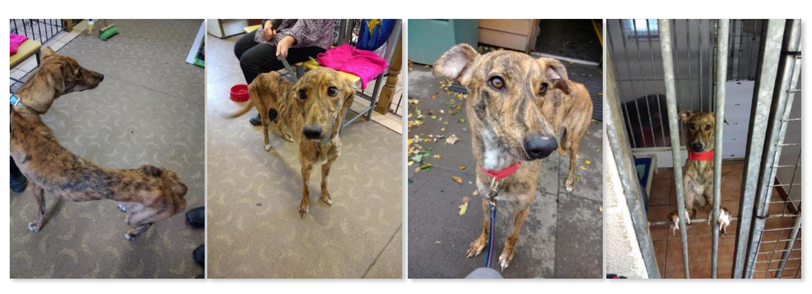
Tanya on arrival

Tanya is a 9 month old lurcher who was brought in to Greyhound Rescue Fife on the 4th September after being neglected with no food or water for who knows how long. As you can see from the pictures she is severely underweight, she also has a gut infection which is now being treated. She seems to be so grateful for all the help she has been getting and loves everyone who comes to visit her. To help GRF with the vet fees, which are likely to be very expensive, Isabelle Freyahound has set up a crowdfunding campaign which has already raised £2,536! Tanya is not out of the woods yes so if you would like to donate, here is the link - <a href="https://www.justgiving.com/crowdfunding/isabelle-andrews-5?utm_term=p3eGp42XJ">https://www.justgiving.com/crowdfunding/isabelle-andrews-5?utm_term=p3eGp42XJ</a> (if the link doesn't work just copy and paste into the bar on your browser). On behalf of everyone at GRF, thank you for donating, every penny truly helps.