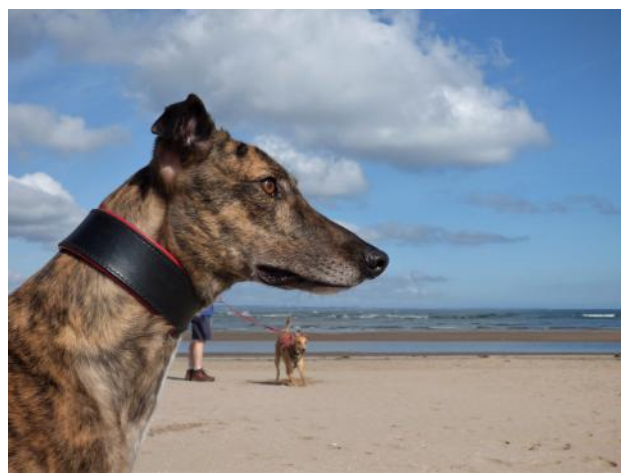
13th of October at Beveridge Park in Kirkcaldy.